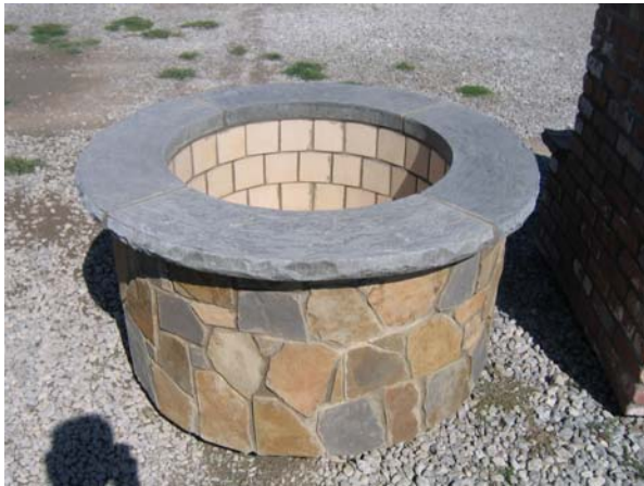
Figure 1. Round Fire Pit

Three generations of fireplace knowledge and experience have gone into the design and construction of the round fire pit. Designed for a patio or back yard installation, it will bring years of pleasure to you provided it is used and maintained properly. A Tall Round fire pit, finished out in a veneer rock facing, is shown in Figure 1.