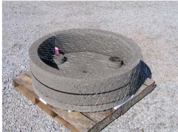
Figure 2. Fire Pit Kit on a Delivery Pallet

The fire pit consists of 3 or 4 (Large Round) sections which are assembled together. It is delivered on a pallet as shown in Figure 2.