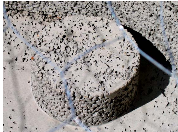
Figure 4. Fire Pit Foot