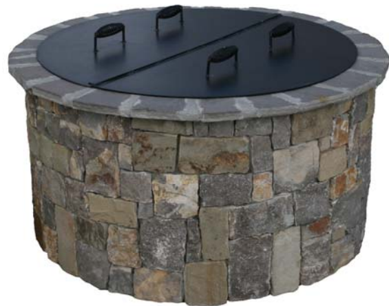
Figure 6. Fire Pit Cover