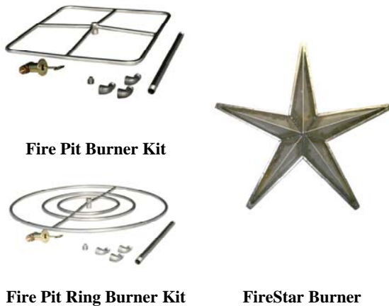
Figure 5. Fire Pit Burner Kits